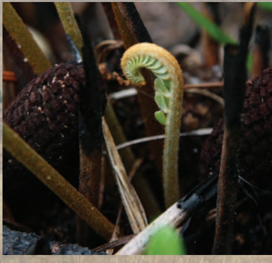
This project also studies the genetic conservation of Zamia integrifolia , the only US Native cycad. This species was nearly wiped out for starch extraction in the 19th and 20th centuries.

We thank the Institute of Museum and Library Services for funding this important project (Grant # MG-245575-OMS-20).