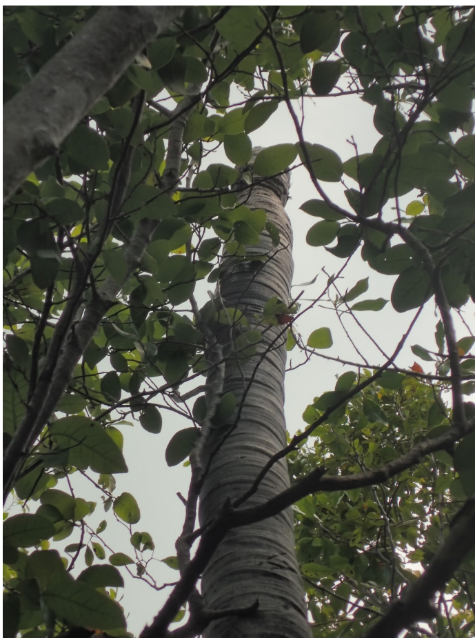
Figure 2. Remaining stump of the third palm.

Fellows, Christina Chavez, Daniela Noblick, and Eliza Gonzalez conducted another status and seed collection investigation. After chartering a boat from Biscayne National Park, they arrived on Elliott Key on April 1, 2019 at 8:30 a.m. Once on the trail, they were quickly surrounded by a relentless and ever-present swarm of mosquitoes. Arriving at the GPS coordinates they were quick to notice the first adult palm was being crushed by an adjacent fallen tree (Fig.1). The full weight of the tree was pressing down on the crown of the palm, severely damaging the apical meristem. What would otherwise have been a healthy reproductive adult, has little to no chance of recovery. Although there were dried infructescence branches still attached to the dying palm, no seeds were found. After a quick reprieve, they were unsuccessful in locating the second palm on the first day.