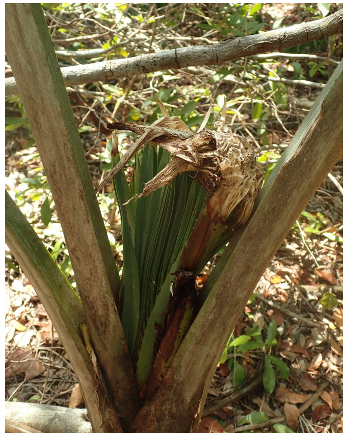
Figure 5. Seedlings from the Fairchild repopulation affected by unknown disease or pest around third palm.