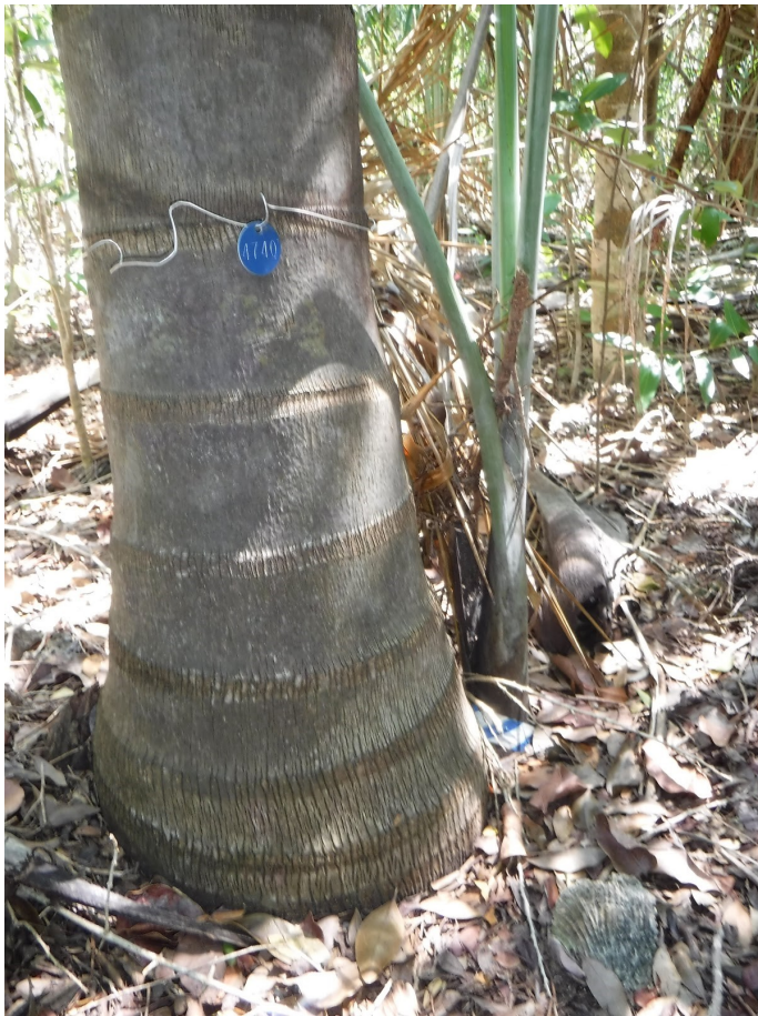
Figure 4. Seedling growing at the base of older Fairchild planting near first palm.

served that one of the taller Fairchild plantings had a smaller seedling growing at the base of its trunk. Given its proximity and height, it could be assumed that the seedling was not an intentional planting, but may be evidence that either the wild palm or one of the older Fairchild reintroductions, was able to produce viable seeds.