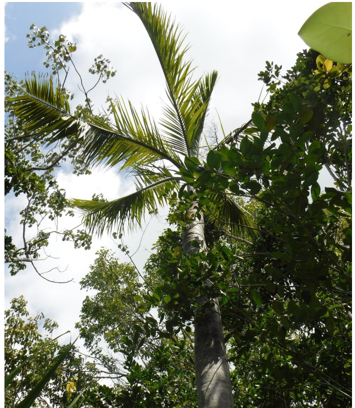
Figure 3. Second palm was found alive, the last remaining wild adult Pseudophoenix sargentii on Elliott Key.

third palm was located at 11 a.m. and was found dead with its degraded fronds decomposing nearby. After collecting the necessary data they were able to locate the second individual just a short trek away. This palm was found to be alive, however, no seeds were found. Much like the first, it also had old infructescence branches still attached. The habitat surrounding the second adult palm was overrun with Thrinax spp.