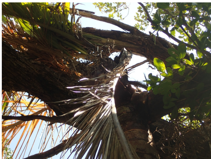
Figure 1. First palm being crushed by adjacent fallen tree.

Following a period of active cyclonic activity in the early 2000s (NOAA 2018), an expedition in 2012 found that there were only eight wild adults of the 28 previously noted (Fotinos, et al. 2015). In 2015, Tracy Magellan, accompanied by Jeremy Schnall, sailed out to Elliott Key to survey the status of the remaining palms and collect seeds. This initiative was supported by Montgomery Botanical Center (MBC) with the intention of collecting seeds to add to the genetic diversity of their current collection of Pseudophoenix sargentii . Though MBC had specimens from five different countries throughout their native distribution, the genetic population from Elliott Key was not represented. The result of the 2015 expedition noted that there were only three remaining wild adults, demonstrating the wild palm's further decline. It is unknown if the impact of Hurricane Sandy in 2012 contributed to that loss. Unfortunately, their efforts to collect viable seeds were unsuccessful (Magellan and Griffith 2017). Four years later, MBC Conservation Horticulture