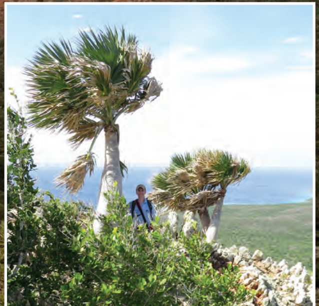
Sabal antillensis grows on windswept, rocky hillsides on the leeward side of Christoffelberg, often on exposed ridges. The leaflets appear to be adapted to this windy, dry habitat.

A collaborative effort between Montgomery Botanical Center and the Carmabi Foundation (Curaçao) thoroughly studied the geography, morphology and anatomy of these palms, and found they deserve their own new name – chosen to honor the Dutch Antilles where they are found.