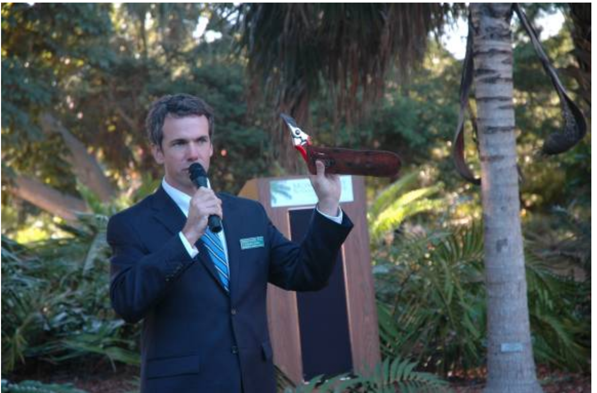
For the “ribbon cutting,” a pair of Swiss-made pruners.