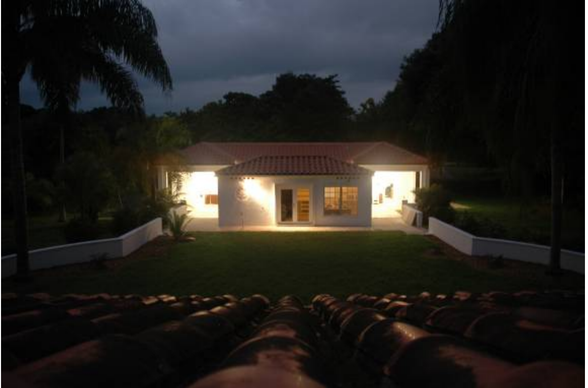
A great day for Montgomery Botanical Center.