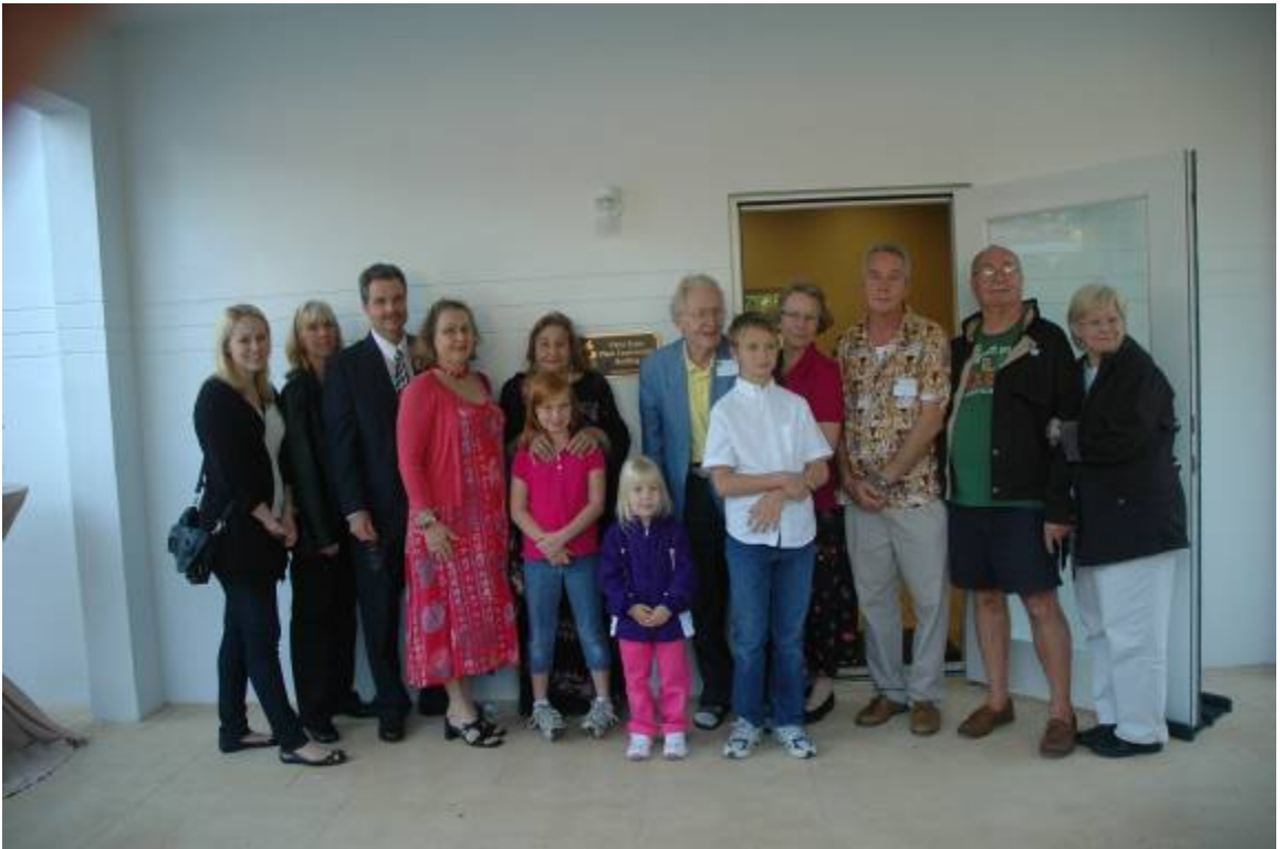
The Tyson Family.