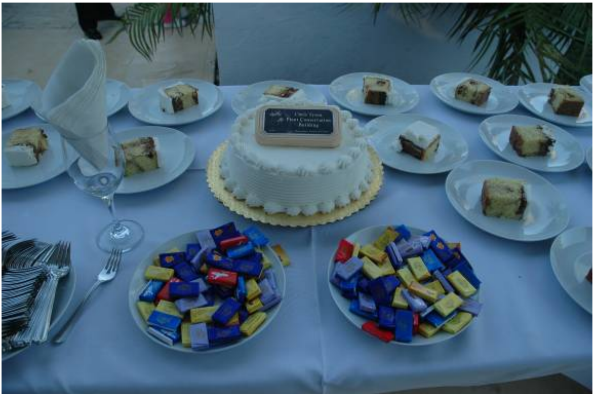
Chocolate and cake.