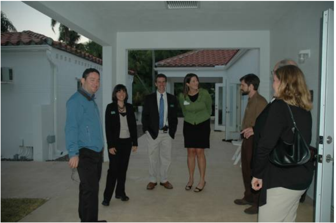
The MBC Team appreciates this generous gift!