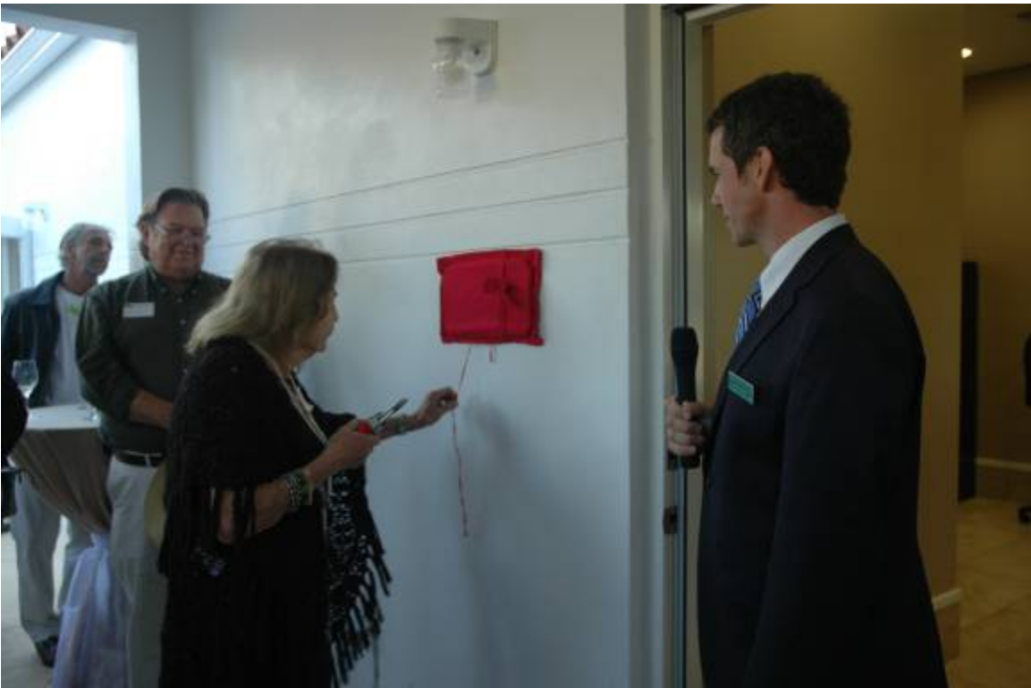
Unveiling the plaque!