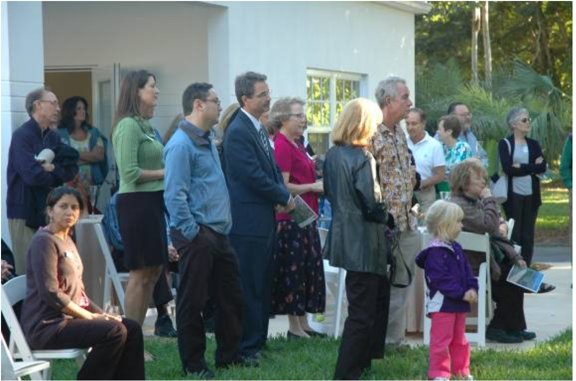
Audience ready for program.