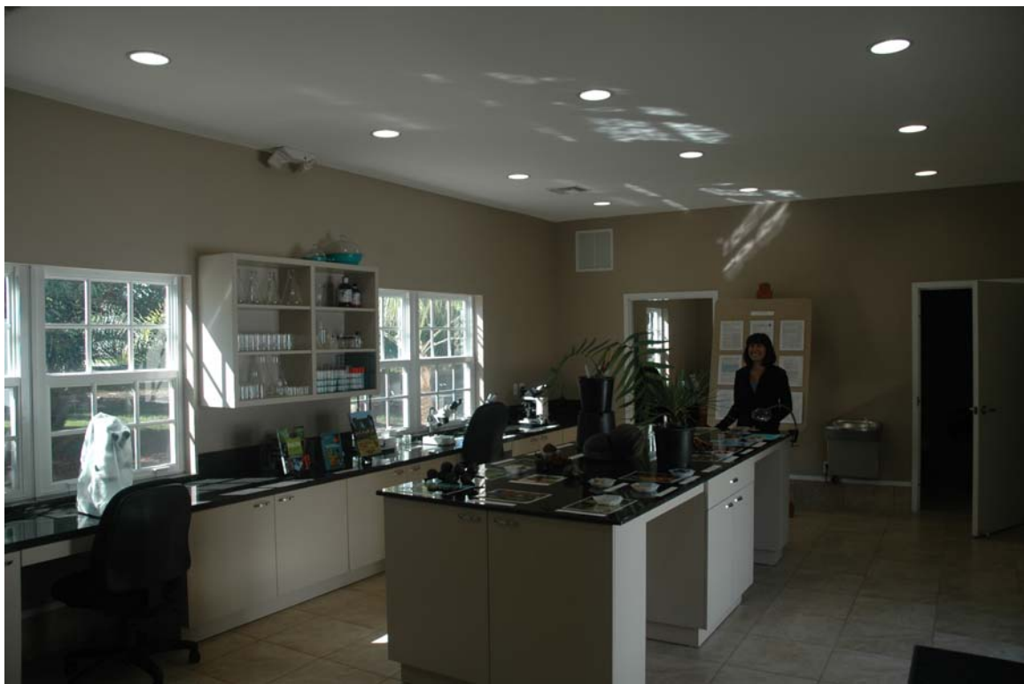
Open House Exhibits; Tracy Magellan.