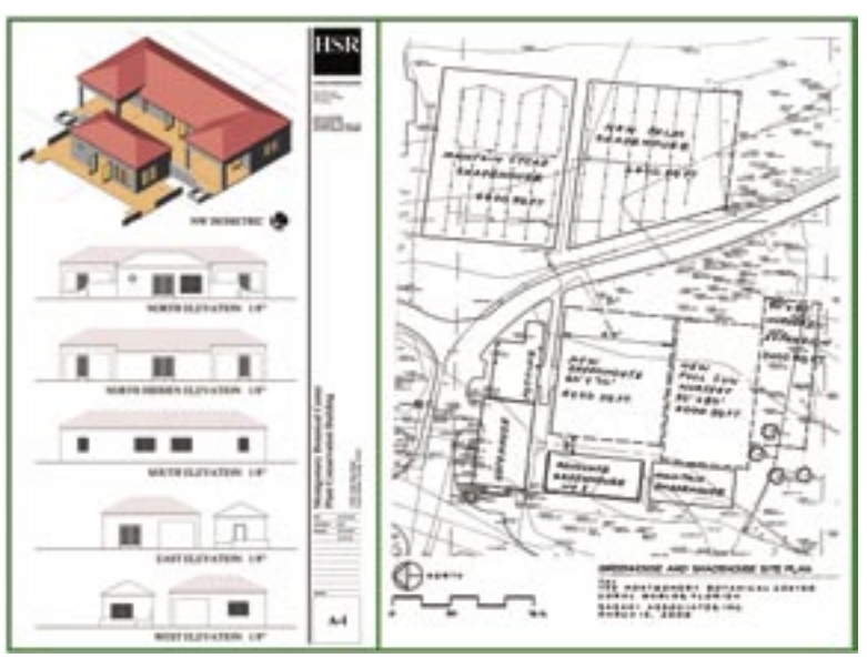
The Near future at MBC: immediate capital improvement priorities. Left: Chris Tyson Plant Conservation Building; Right: Nursery expansion plans.

servation Building, to advance our collaborative research capacity. Plans are developing for an expanded nursery complex, crucial for the increasing seed obtained by our work abroad.