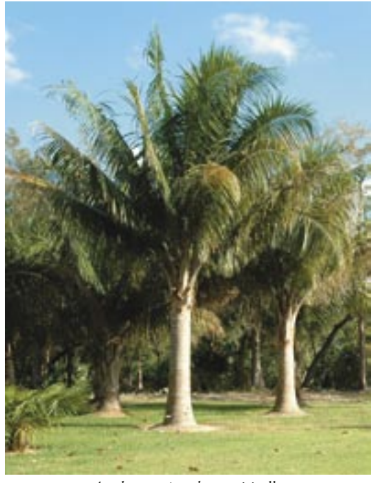
Attalea crassispatha, a critically endangered palm species of Haiti

For MBC, acquisitions such as Attalea crassispatha highlight our efforts in the area of conservation: as Palm Curator, I was thrilled to have such an important palm become part