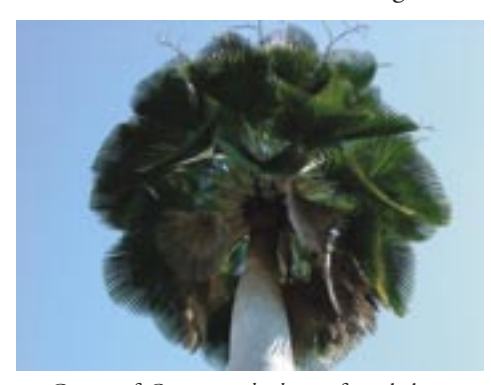
Crown of Copernicia baileyana from below

it would likely compete with the Royal Palm as a choice for avenue plantings, were it not for its slow rate of growth.