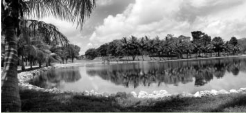
View of Nell's House looking across Coconut Lake in the Lowland Palmetum.